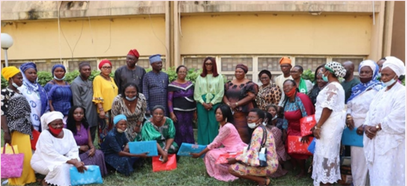
Special guest, representative of the sponsor, committee members, facilitators and participants in a group photograph.