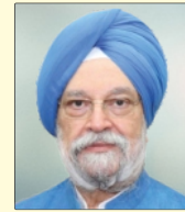
Shri Hardeep Singh Puri Hon'ble Minister of Petroleum & Natural Gas, Housing & Urban Affairs, Government of India