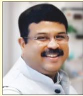
Shri Dharmendra Pradhan Hon'ble Minister of Education, Skill Development & Entrepreneurship, Government of India